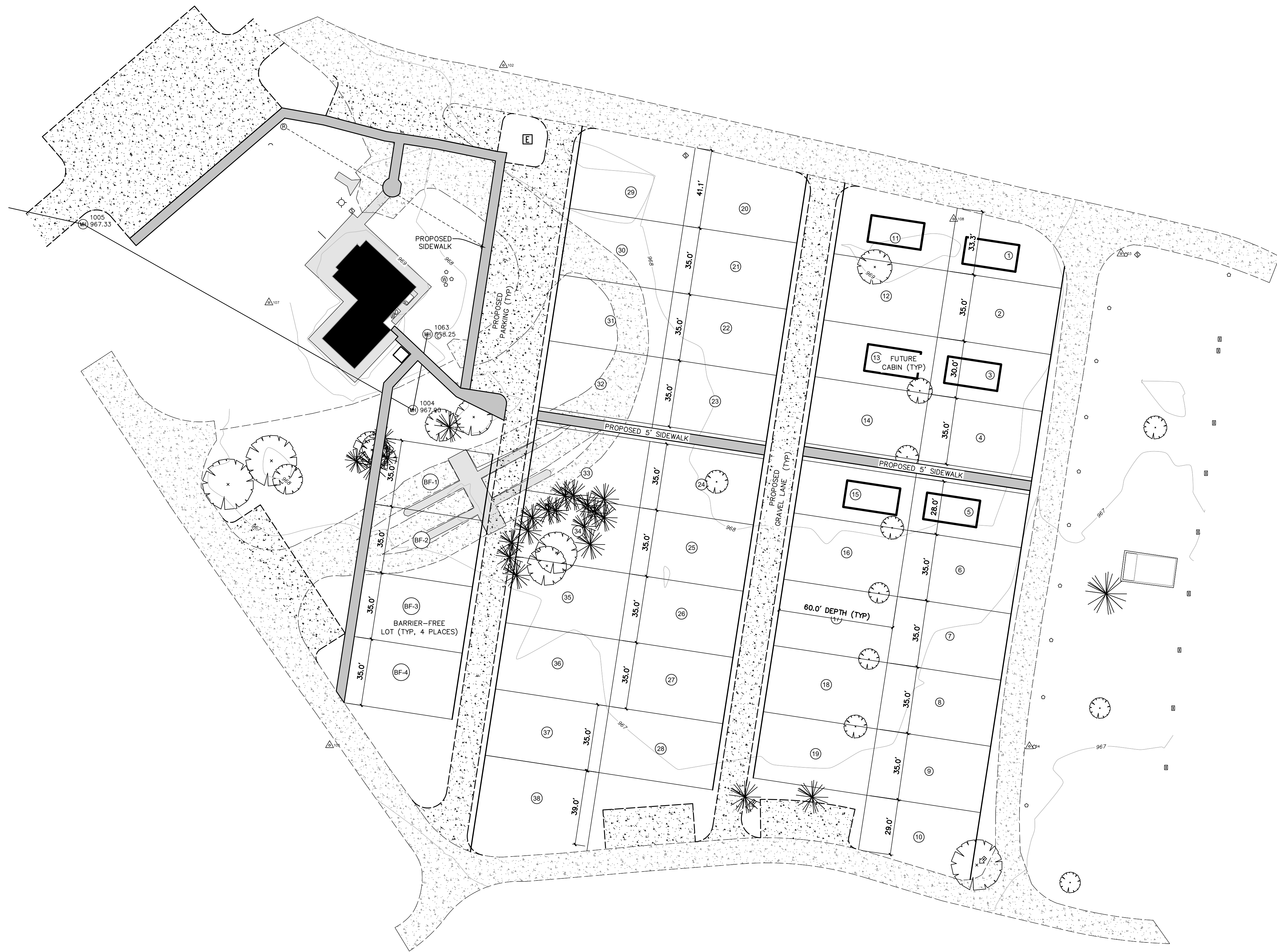
PROPOSED LAYOUT SCALE : 1" = 30'